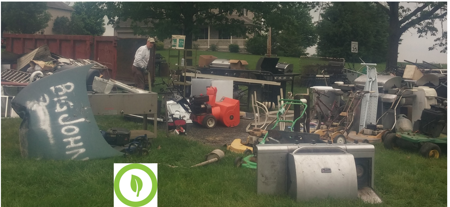
The Penn-Elm area Lions Club, 14-D , held their seventh scrap metal drive recently to raise funds to support the Penn-Elm Club Park and other club projects. Five large containers were filled with a total of 33,720 pounds of scrap metal for a net worth of approximately $2,100. Many times someone dropping off metal searches through the piles to find something he needs and then makes a monetary donation to the club for the item.