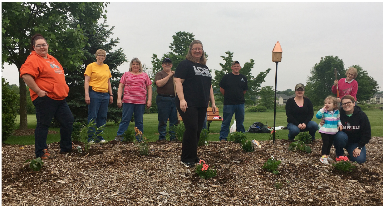
The Wilshire Hills Lions Club, 14-D , added a butterfly garden to the Woods Edge Park in their community. The garden goes along with the bench the club added to the park last year.