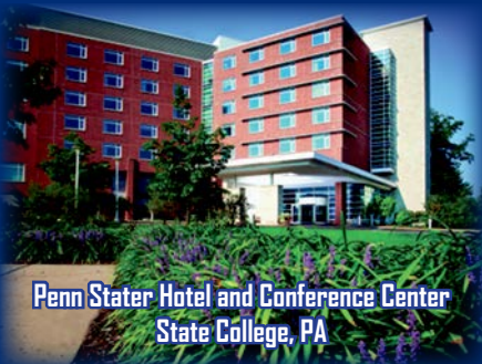
Penn Stater Hotel and Conference Center State College, PA