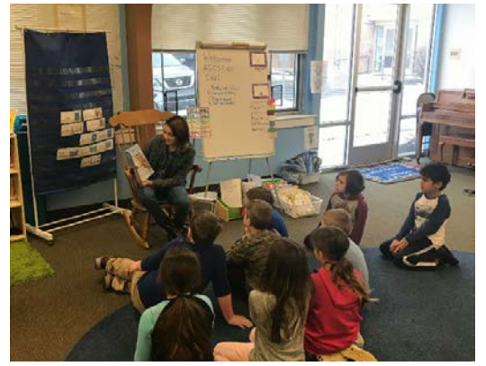
...went to the charter school's Early Learning Center to read and play games with about 100 of the students.

...made gold ribbons (left) for Childhood Cancer Day on February 15. The ribbons were handed out to the students to bring awareness to childhood cancer.