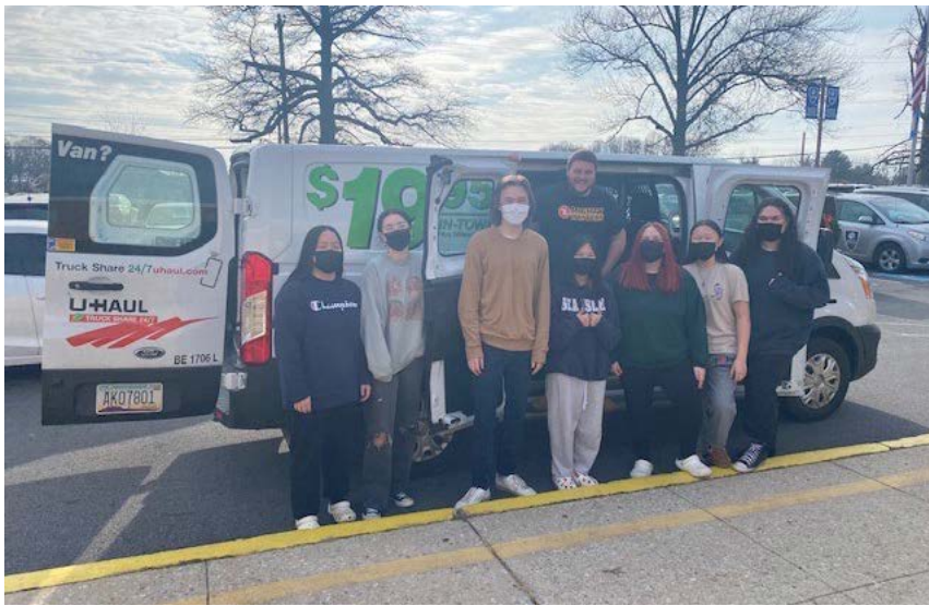
(Left) Avon Grove Leos, 14-P , collected more than 1,100 food items that were donated to Mighty Writers in Kennett.