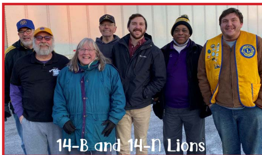
14-B and 14-N Lions