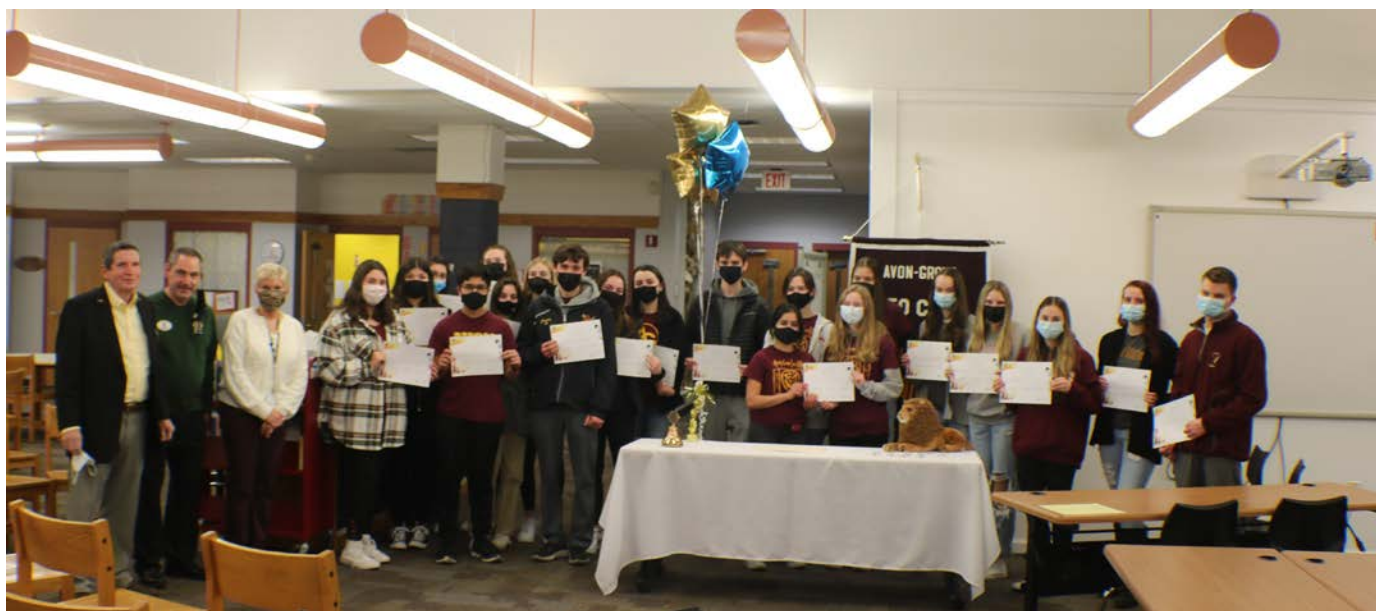
Avon Grove High School's Newest Leo Club Members

https://www.lionsclubs.org/en/resources-for-members/resource-center/leo-faqs