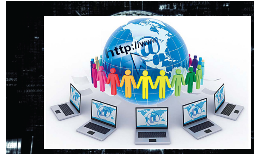
This Photo by Unknown Author is licensed under CC BY-SA CC BY-NC-ND