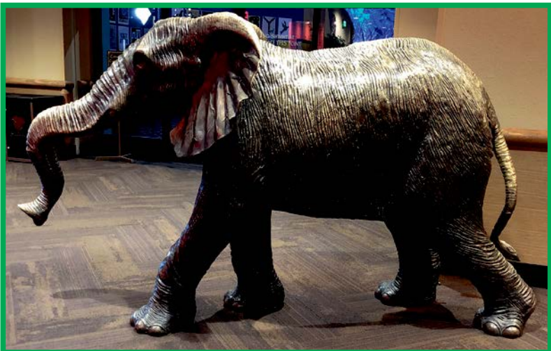
Lions weren't the only "animals" roaming the Kalahari during the 2019 MD-14 convention. The menagerie on display throughout the complex truly helped make this year's event a "roaring" success and one to remember.