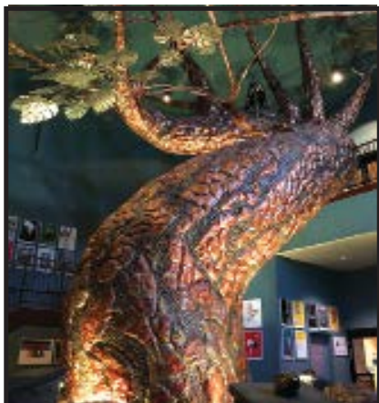
One of the many colorful examples of artwork on display during this year's state convention at Kalahari Resorts & Conventions in Pocono Manor.